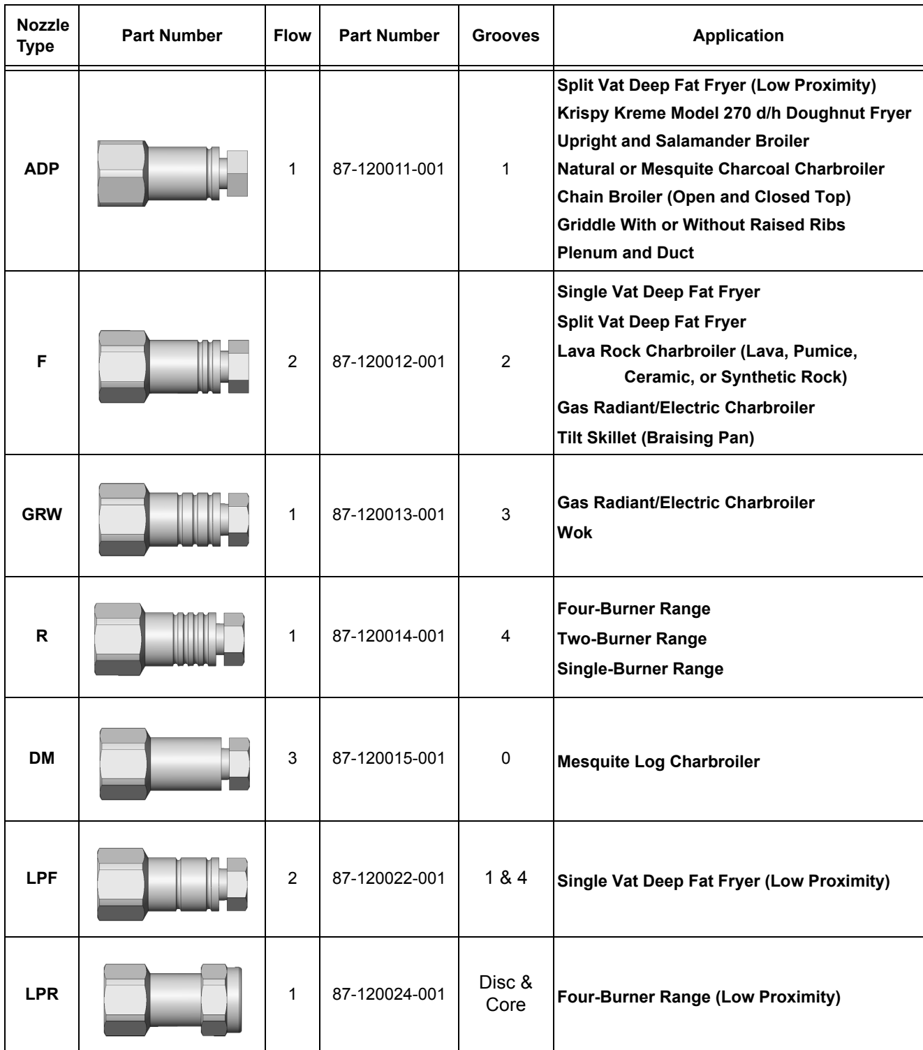
Table 1: Nozzle Application Information